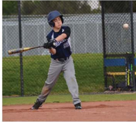
Harvey ready to let rip