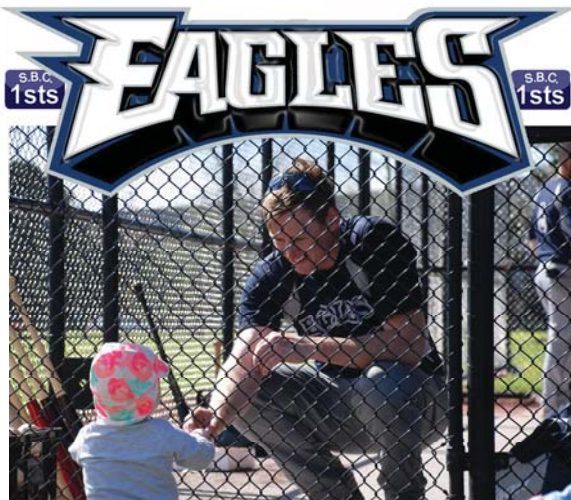
Creasy: Still able to fit in some quality family time !