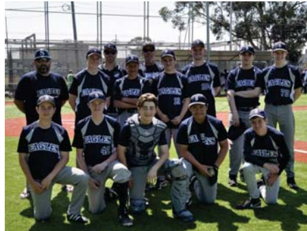
SUNDAY BEST: From the youngest Sunday All Stars, to our U18s combined team.