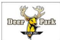
DEER PARK CLUB