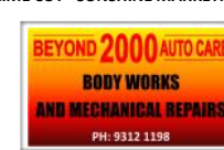
BEYOND 2000 SUNSHINE