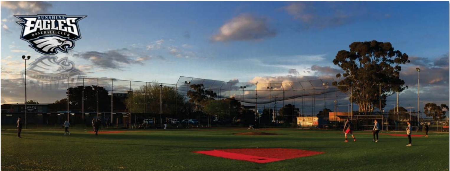
Women's: Getting in some nice ground ball work!