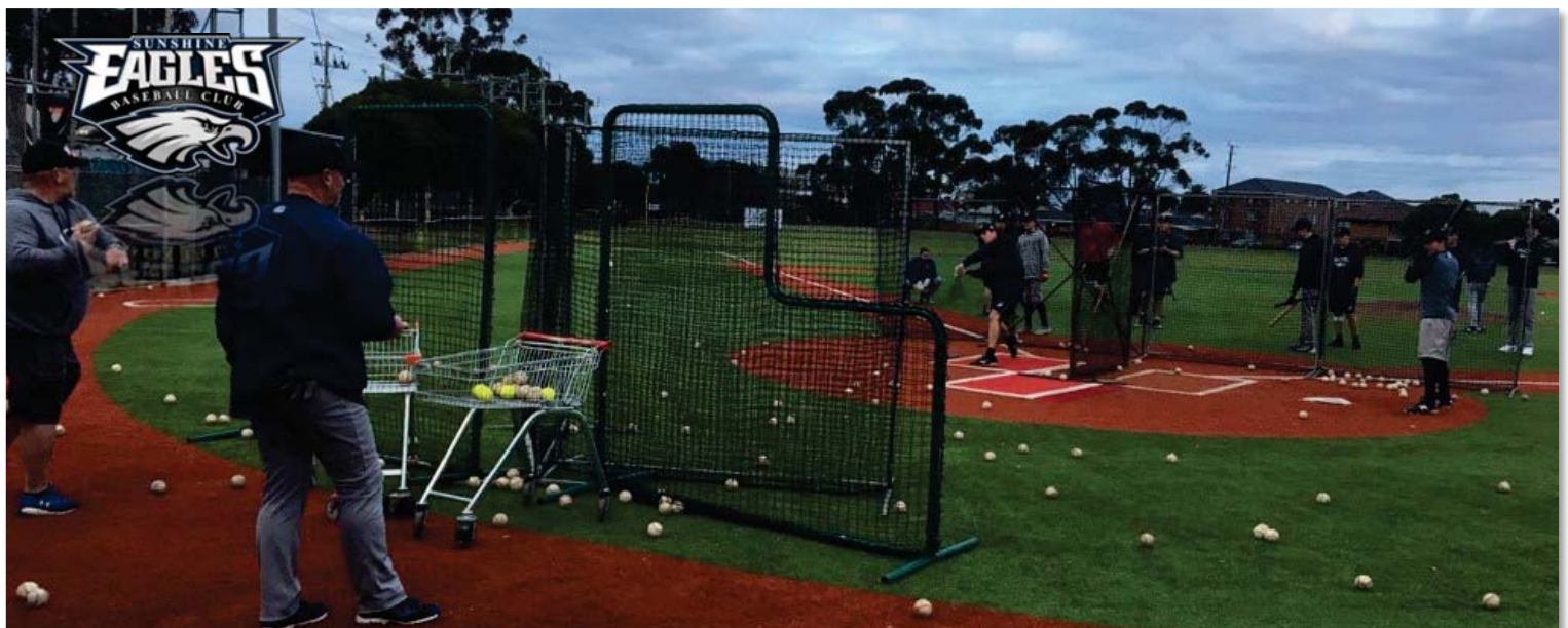
Seniors: Nothing better than a few good rounds of BP