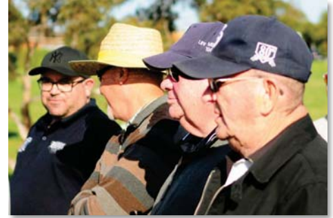
Winter Seniors: Some action on and off the field